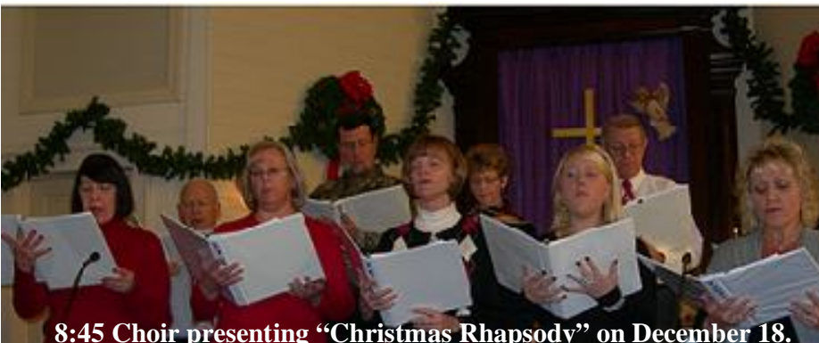
8:45 Choir presenting "Christmas Rhapsody" on December 18.

The cost is only $3 for adults and $1.50 for children with no family paying over $10. Plan to attend and let us know you are coming by filling out a reservation slip in the Sunday bulletin or calling 764-0789.